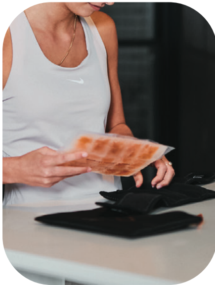
2. Insert into the compression brace