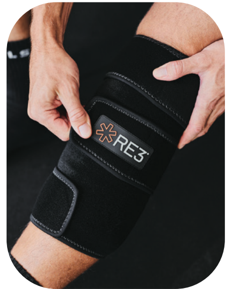
3. Wrap your injury & keep moving